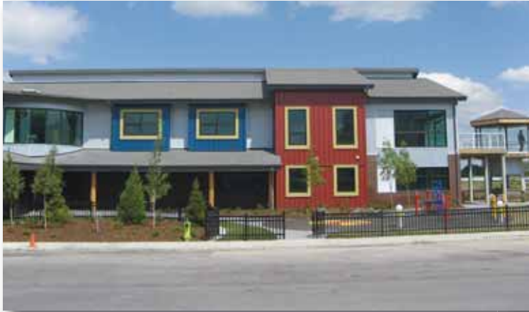
Rotary Flames House, Alberta's first free-standing children's hospice.