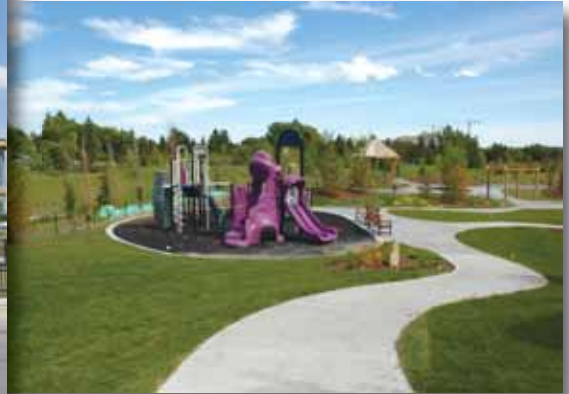
The new park at Ronald McDonald House.