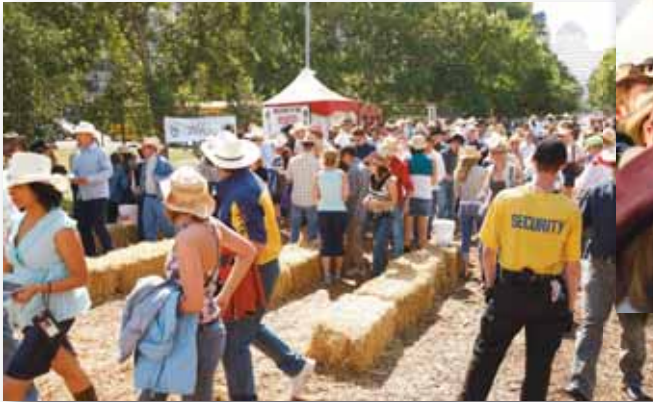
The crowds were streaming through the gates.