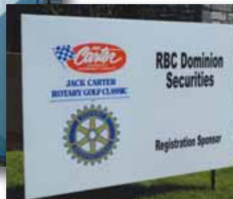
One of the many generous sponsors of the tournament.