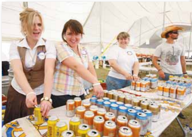
Volunteers help out at the beer garden.