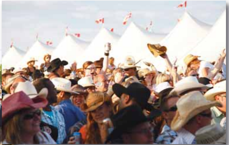
Having fun – Calgary Stampede style!