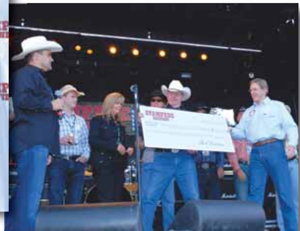
Another hugely successful fundraiser - $200,000!