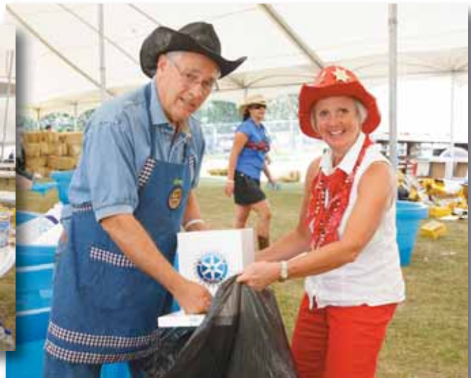
Our volunteers make this event so successful.