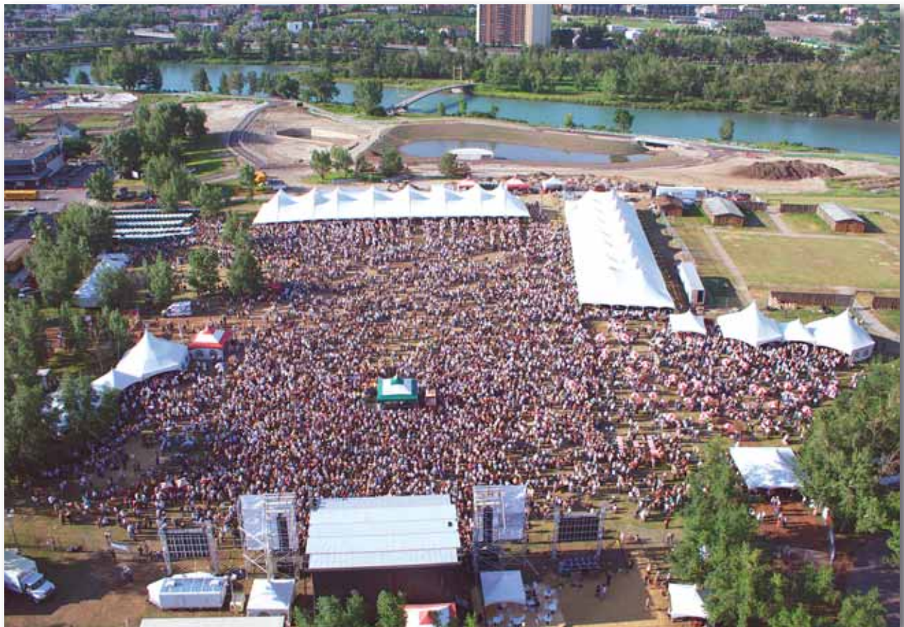
July 2008 Stampede Roundup at Fort Calgary.

It is our mission to embrace the ideals of Rotary International, contributing to a better Calgary and a better world through significant service while providing extraordinary opportunities for networking, fellowship, friendship and personal growth.