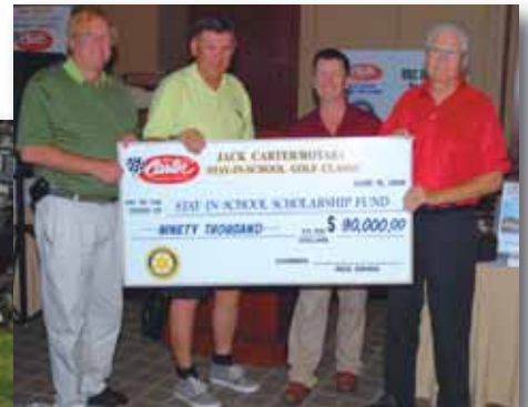
Once again, a fabulous fundraiser – $90,000!